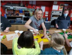
Boards, bikes and baguettes